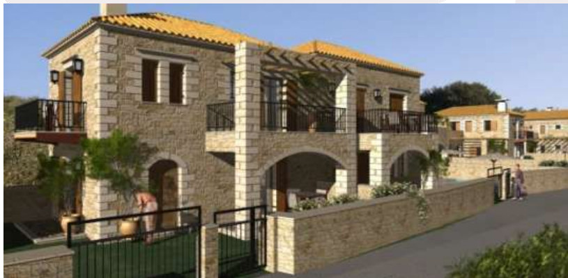
Development - Construction eight holiday homes, Gavalochori, Chania

Development - Construction , private and commercial properties