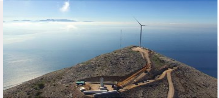
Wind farm with 2 wind turbines, 4,5 MW, Rio-Antirio - Greece

Facilities construction - Road construction - Aggregate production.