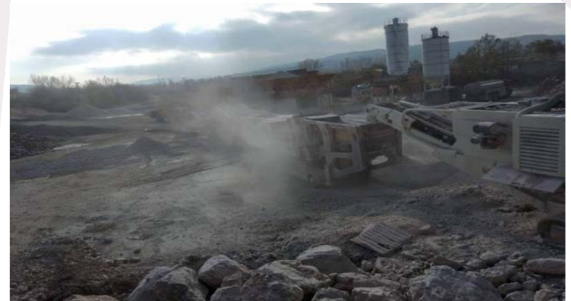
European route X, E75 Motorway, Serbia