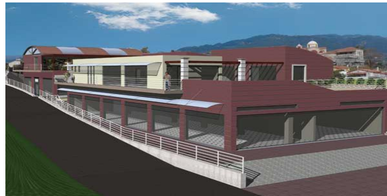
Development - Construction Palaia EO Patras - Aigiou mall