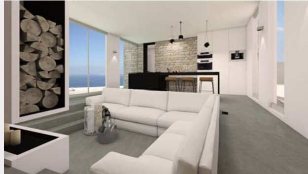
Tourism property development, Falasarna Villa, Chania, Crete