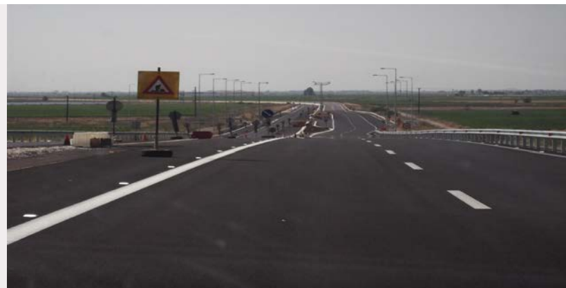
E.O.N. Monastery – Karditsa, N. Monastiri district

Aggregate production - Road construction