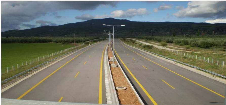
Ionia odos motorway (Arta - Menidi)