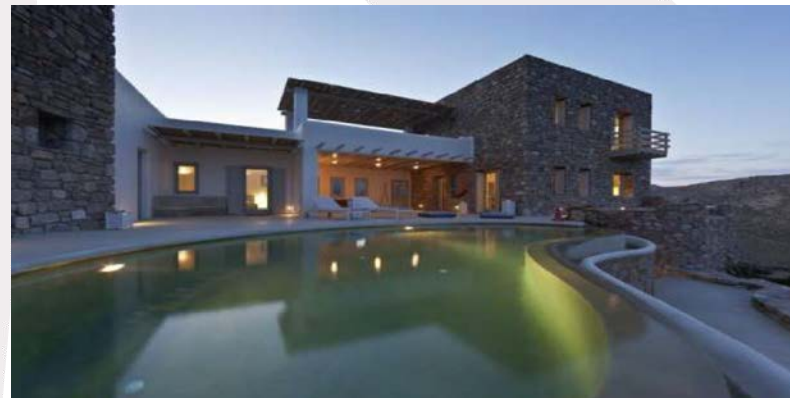
Development - Construction holiday home, Mykonos, Cyclades