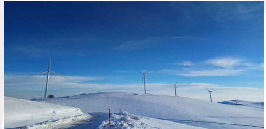
Wind farm with 18 wind turbines, annual energy output 22 MW, Veria mountain - Greece