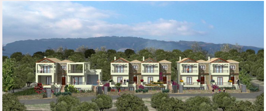
Five double storey detached houses, Mpouka, Kamares, Achaia