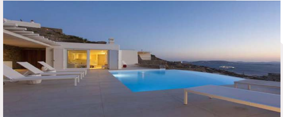
Luxury villa, Mykonos, Cyclades