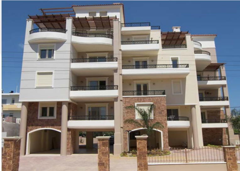
Four-storey block of flats, Nea Chora, Chania, Crete