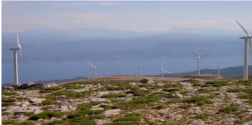
Wind farm with 40 wind turbines, annual energy output 65 MW, Panachaiko mountain, Achaia - Greece