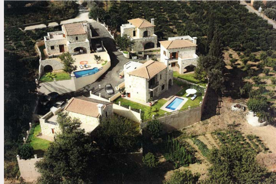
Five traditional double storey detached stone houses, Nergiana, Chania, Crete