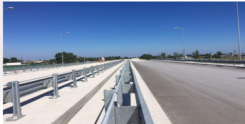
Katerini ring road